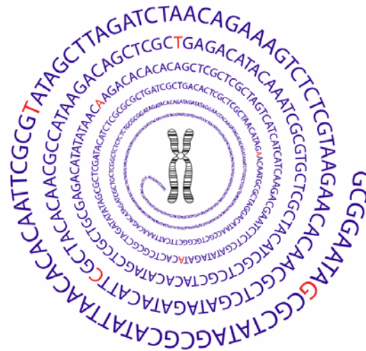
Sequence Map (c.2001)